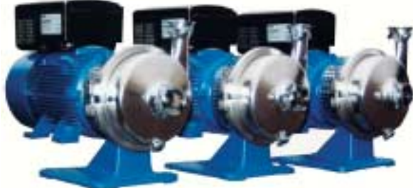
Kalrez® parts in pumps and valves help maintain purity in process fluids and meet critical health and safety requirements.